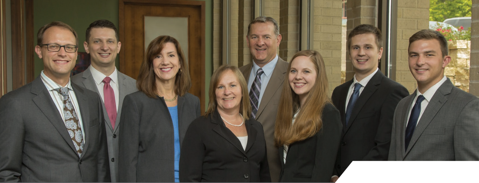
Business Valuation & Litigation Support Team